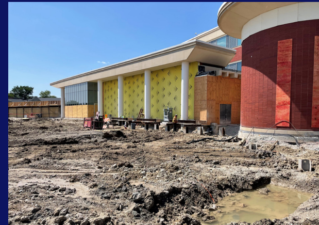
Northwestern Lake Forest Hospital Master Campus Plan $389 million phased approach to reconfigure the campus and increase capacity.