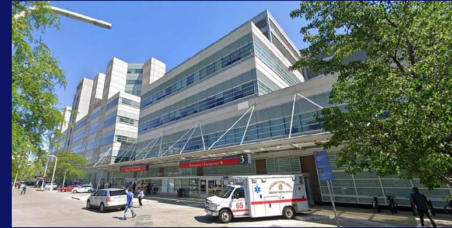
Cook County Health & Hospital Portfolio Program and Project Management Services $400 million capital improvement investment among several hospitals.